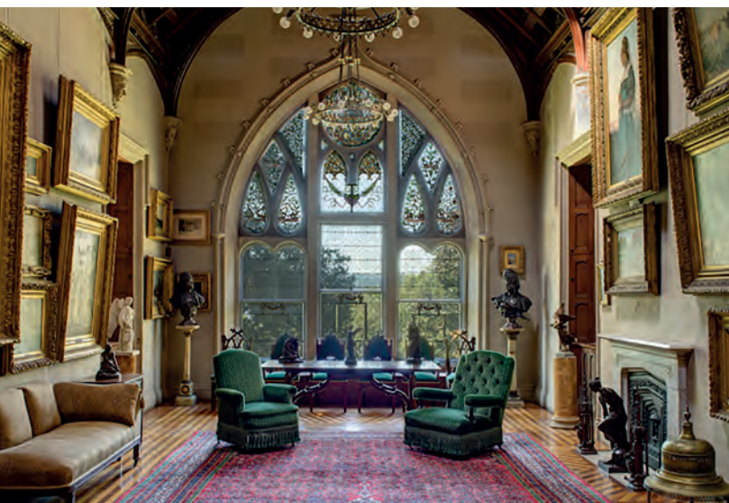
Lyndhurst, Hudson Valley

Land Rate: $3,999 per person, double rate