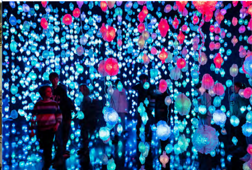
Installation by Pipilotti Rist, Kunsthau Zürich, Switzerland

Land Rate: $13,499 per person, double rate