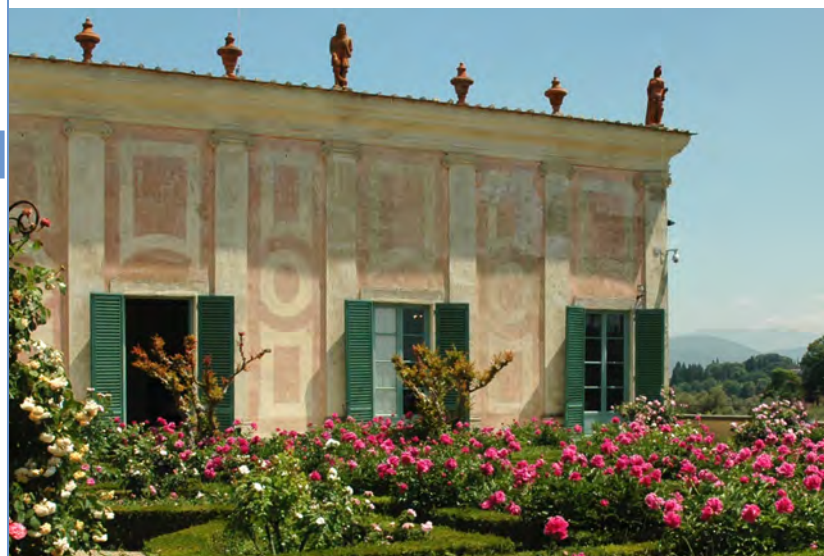
Palazzina e Bastione del Cavaliere, Boboli Gardens, Florence

Cruise Rates: From $8,999 per person, double rate