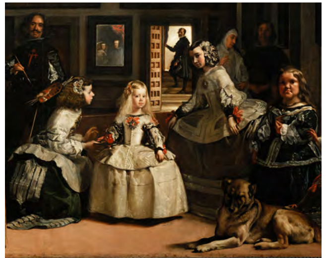
Ghent, Belgium (left) and Diego Velázquez, Las Meninas, 1656, Museo del Prado, Madrid (right)

For reservations, please call 212.324.1893 or 855.533.0033 • All prices are per person, double occupancy www.museumtravelalliance.com • email: trips@museumtravelalliance.com