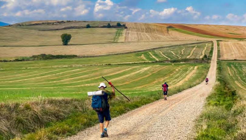
Walking the Camino, Northern Spain