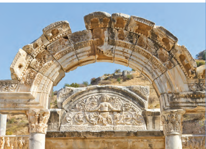
Ruins of Ephesus, Turkey

Cruise Rates: From $8,999 per person, double rate