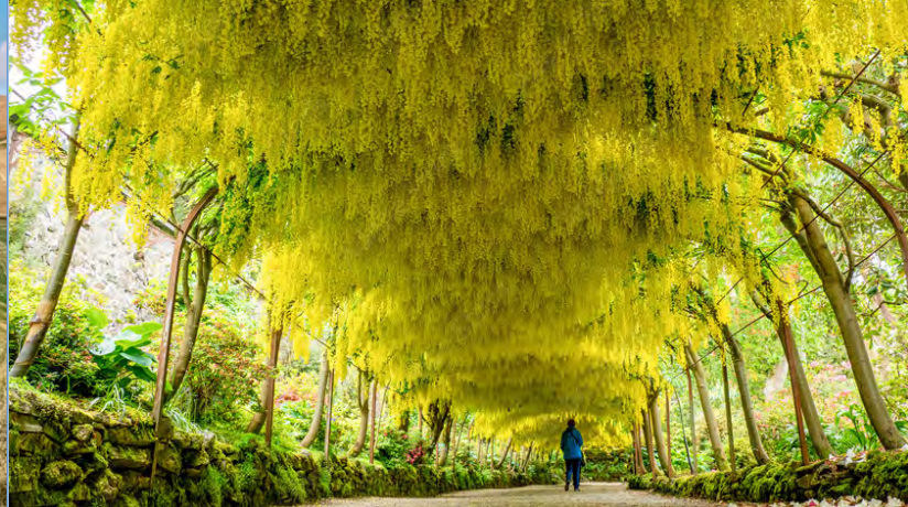
Bodnant Gardens, Wales