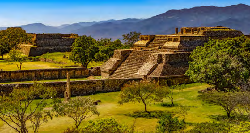
Monte Albán, Mexico