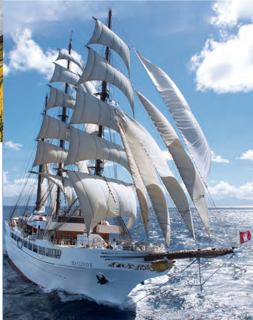
Sea Cloud II

Some of the world's most extraordinary Greek temples grace the rugged landscape of Italy's entrancing island of Sicily. Discover these pearls of antiquity as you sail aboard Sea Cloud II . On this week-long cruise, Sicily will reveal her rich and unique culture as you walk in storied cities that were once centers of the Greco-Roman, Carthaginian, and Byzantine worlds, and enjoy warm welcomes to the dazzling private palazzi of local nobility.