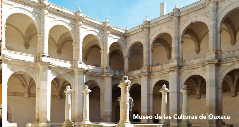
Museo de las Culturas de Oaxaca

NOT INCLUDED IN RATES International airfare; passport/visa fees; meals not specified; alcoholic beverages other than noted in inclusions; personal items and expenses; airport transfers other than for those on suggested flights; excess baggage; trip insurance; any other items not specifically mentioned as included.