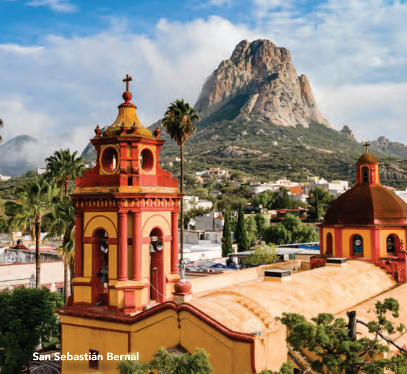
San Sebastián Bernal