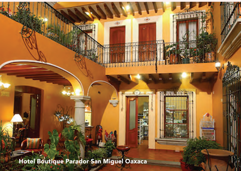
Hotel Boutique Parador San Miguel Oaxaca