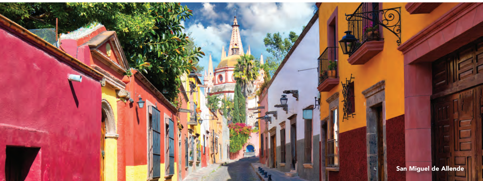
San Miguel de Allende

DISCLAIMER: This itinerary is subject to change at the discretion of Museum Travel Alliance. For complete details, please carefully read the terms and conditions at https://museumtravelalliance.com/faq.php .