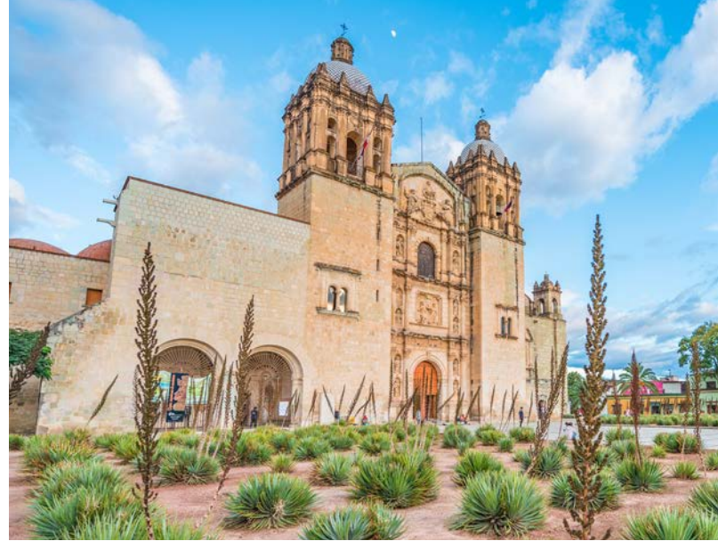
Templo de Santo Domingo, Oaxaca