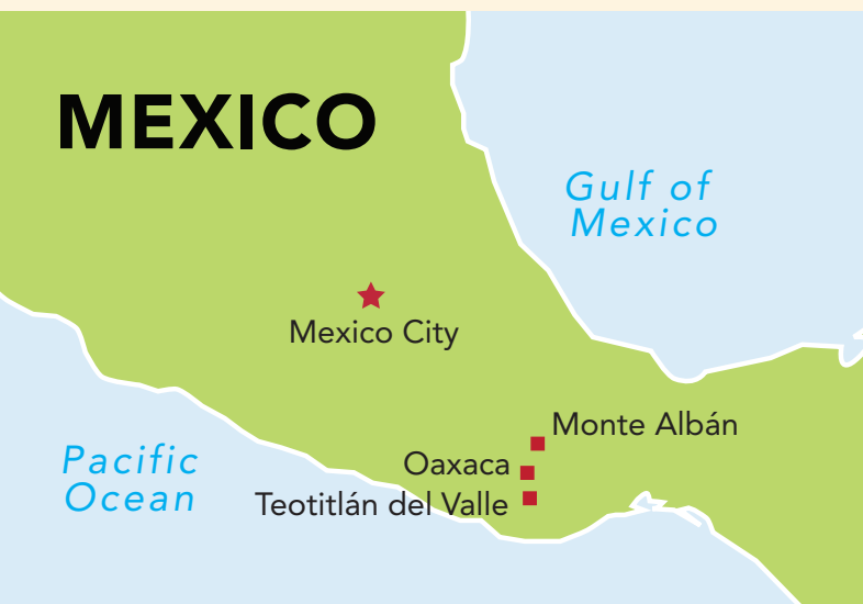
Map of the region

at the National Institute of Fine Arts in Mexico before she moved to Puerto Rico to work at the Museo de Arte de Ponce, where she was the director from 2013 to 2021.