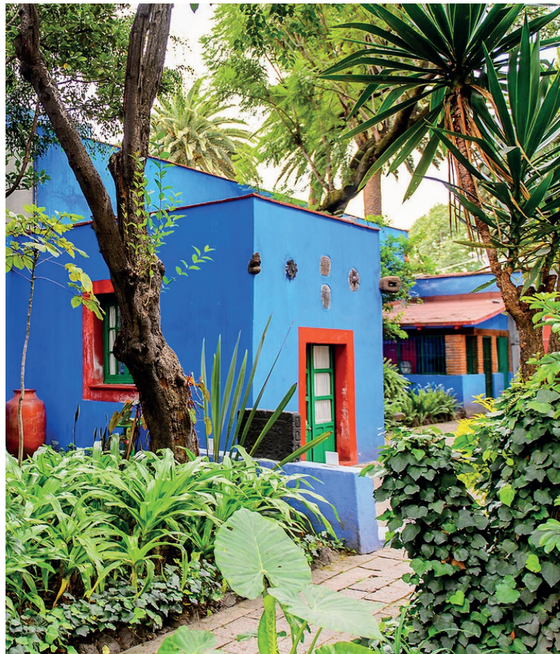
Casa Azul, Mexico City

Gather for a delightful lunch at Lago/Algo, a venue that seamlessly blends contemporary art, stunning architecture, and gastronomic delights. This extraordinary establishment, managed by the renowned art gallery OMR, has breathed new life into a pre-existing modernist building from 1964. From its vantage point overlooking the picturesque Lake Chapultepec, savor a culinary feast that harmoniously complements the artistic ambiance.