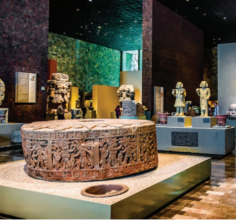
Museo Nacional de Antropología, Mexico City