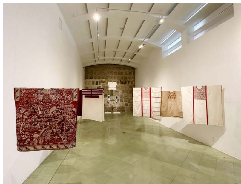
Museo Textil de Oaxaca

In the afternoon, take a walking tour of the city's historical center, stopping at the baroque Templo de Santo Domingo, a stunning example of Spanish colonial architecture and home to a number of important works of art. Enjoy the traffic-free Zócalo, Oaxaca City's main square, with its elegant portales , and browse through the city's colorful markets, where you can find everything from traditional handicrafts to fresh produce. Delve into Oaxaca's rich textile tradition during a guided visit at the Museo Textil de Oaxaca, which houses a collection of more than 10,000 textiles, many of them a century or more old. This evening, venture off the beaten path to a local mezcaleria to taste mezcal , sampling its distinctive smoky flavor. Dinner is at leisure. B,L