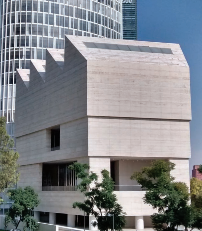
Museo Jumex, Mexico City

Afterwards, take a special guided visit to the Museo Jumex, which holds one of Latin America's most extensive private collections of contemporary art. Designed by the architect David Chipperfield, this remarkable museum showcases works by acclaimed artists such as Andy Warhol, Cy Twombly, and Damien Hirst. Dinner tonight is at leisure. B,L