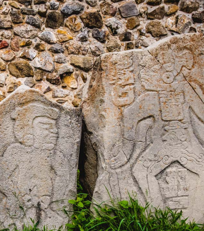
Mayan Carvings, Monte Albán