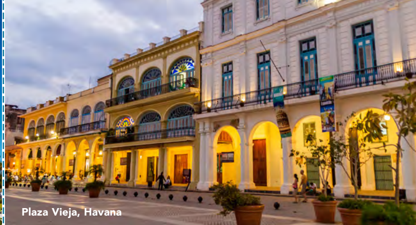
Plaza Vieja, Havana

To reserve a place, please call Museum Travel Alliance at 212-324-1893 or 855-533-0033, fax: 212-344-7493; email: trips@museumtravelalliance.com ; or complete and return this form with your deposit of $1,000 per person (of which $500 is non-refundable for administrative fees) to Museum Travel Alliance . Mail to: Museum Travel Alliance, 260 West 39th Street, 17th Floor, New York, NY 10018-4424.