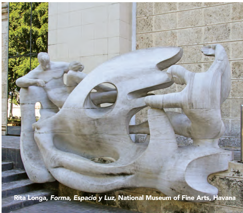
Rita Longa, Forma, Espacio y Luz , National Museum of Fine Arts, Havana

Head outside of the capital to the small, hilltop village of San Francisco de Paula for a visit to Finca Vigía (Lookout Farm), the house where Ernest Hemingway lived for 20 years. View the rooms through open windows from the surrounding terraces; see Hemingway's famous fishing boat Pilar ; and climb the tower to his study. Our excursion concludes with a brief visit to the village of Cojimar, the setting for The Old Man and the Sea . After lunch, return to Havana and gather for a lecture on the island's current realities by a former ambassador who was once Deputy Minister for Foreign Affairs. In the early evening, attend a private after-hours tour and reception at the Museo Nacional de la Cerámica Contemporánea Cubana, followed by dinner at a local paladar . B,L,D