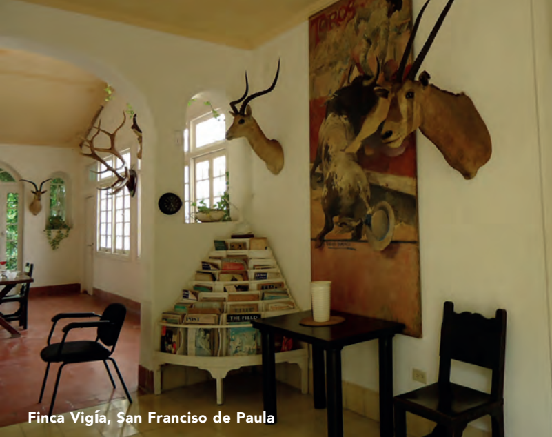
Finca Vigía, San Francisco de Paula