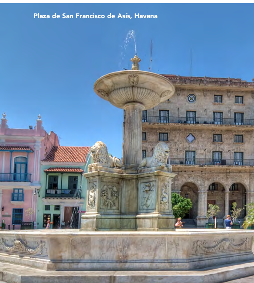
Plaza de San Francisco de Asís, Havana