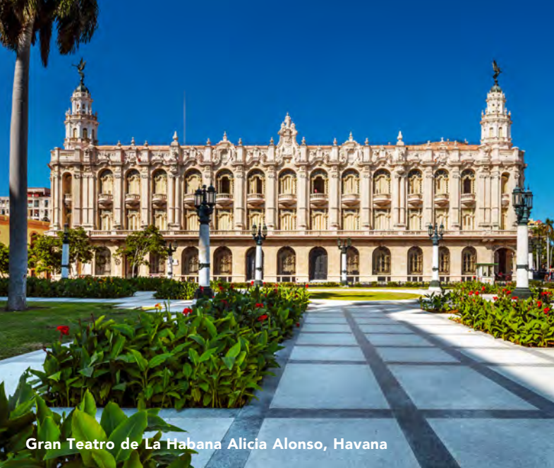
Gran Teatro de La Habana Alicia Alonso, Havana