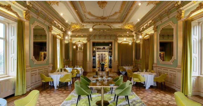
Vila Foz Hotel & Spa, Porto

Set in Porto's patrician neighborhood facing the Atlantic Ocean, this 19th-century manor preserves its original architectural elements and features a sauna, Turkish bath, and spa.