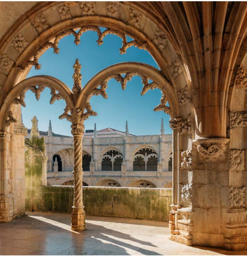
Mosteiro dos Jerónimos, Lisbon