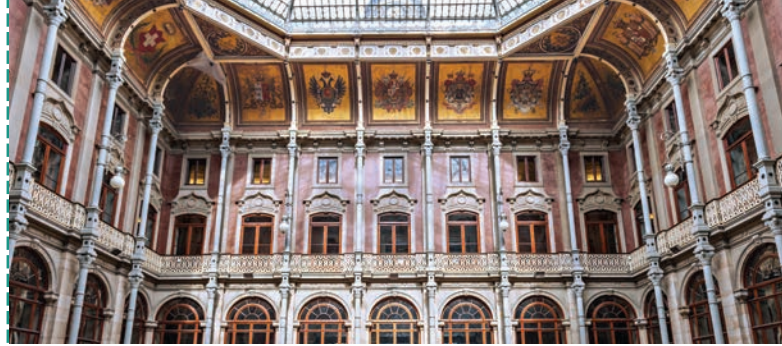
Palácio da Bolsa, Porto

Cover photo: Palácio Nacional de Queluz, Sintra. Highlights page: Azulejo