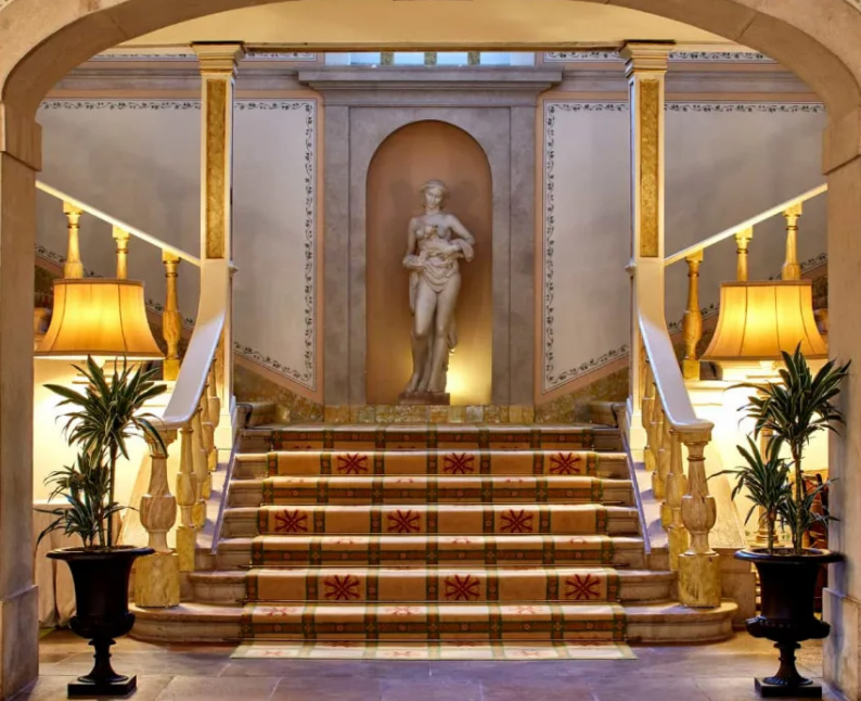
Tivoli Palácio de Seteais, Sintra