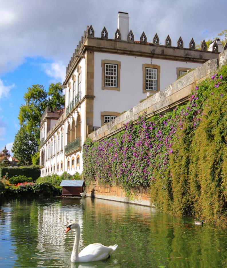
Parador Casa da Insua, Penalvo do Castelo

After lunch on the premises, discover the magical Quinta da Aveleda. Amidst rare, centuries-old tree species, you will see a lake, a Manueline window from the 16th century, the teahouse, and two fountains—all part of a legacy that has been preserved on an eight-hectare romantic garden. The nearly 100 species of camellia trees line an avenue, which fills with different colors at the beginning of spring. The estate's main building dates to the 17th century and features several trees on the premises that have been in situ for centuries. Conclude with a wine-tasting experience matched with cheeses produced on the estate. This evening, dinner is at leisure for you to sample Porto's acclaimed culinary scene.