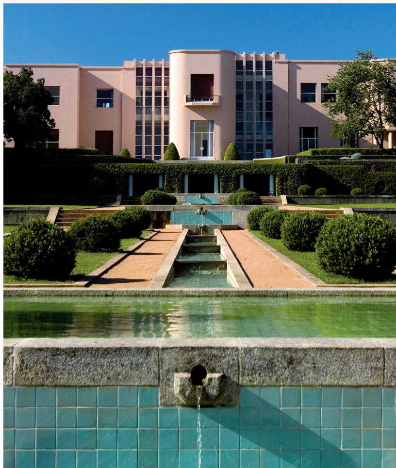
Fundação de Serralves, Porto

PLEASE NOTE: This itinerary is subject to change at the discretion of History Center of Lake Forest-Lake Bluff and Arrangements Abroad. For complete details, please carefully read the terms and conditions at www.arrangementsabroad.com/terms .