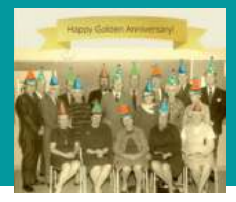
Board of Directors, Lake Forest-Lake Bluff Historical Society, 1972