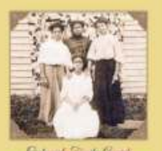
Continued County Contain Henoring the Lawress Jonian Family Gas 2, 2022