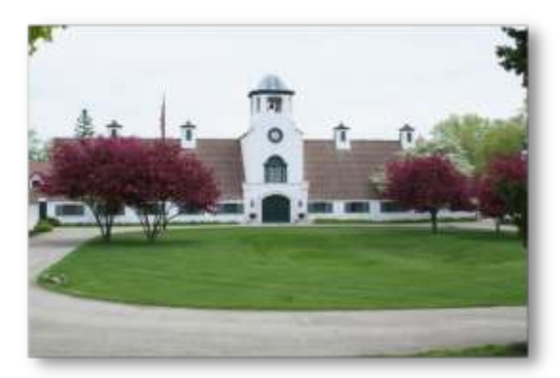
CRAB TREE FARM