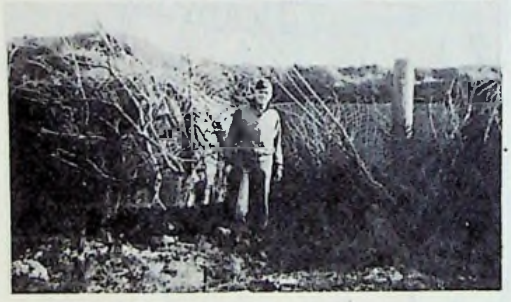
Eddie Swift inspects German pill box at Dieppe