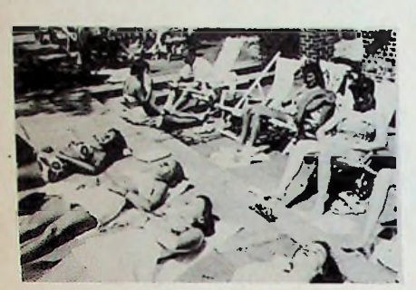
Sight for sore eyes