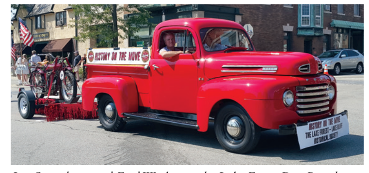
Jim Swarthout and Fred Wacker in the Lake Forest Day Parade