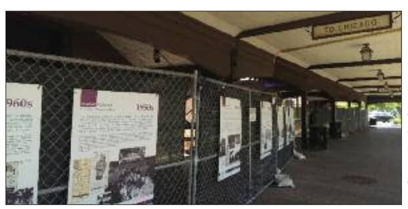
"Market Squared: Ten Decades of Business and Beauty" panels at the East lake Forest Train Station (at left) and in Market Square shop windows (below).

The exhibit also presented a chronology of Market Square's ten decades, punctuated with anecdotes and photographs that reveal how the place has changed over time.