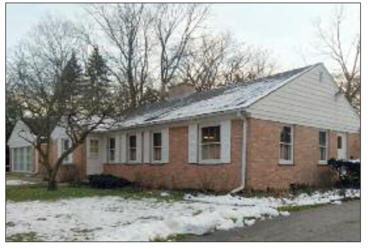
The offices are now located adjacent to the new museum space, in the future Research Center.

This new location enables us to continue providing superior service to researchers while evolving the organization to celebrate our community's unique and special history through programs and exhibits.