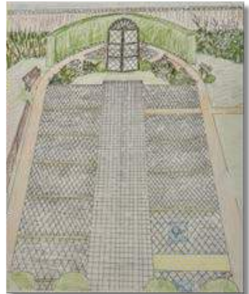
The Reid-Anderson Family Traditional Garden and Grand Entrance

The transformation of the grounds takes the visitor from the turn-of-the-century traditional, Midwestern estate garden through the romantic, transitional style that is still present in our community and beyond.