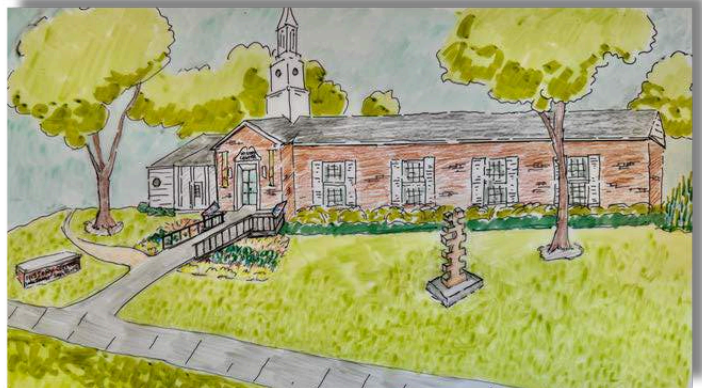
The Maxine and Tom Hunter Modern Garden