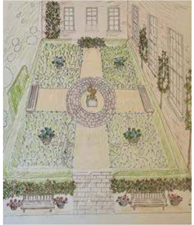
The Tom and Ellen Walvoord Traditional Courtyard Garden