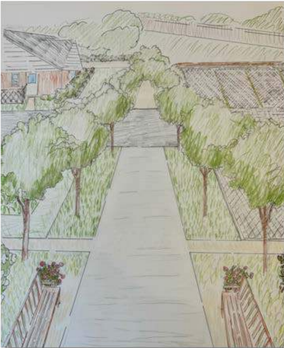
The Allee Entrance Path for the Museum and Archives

Walking paths to every garden will be ADA-compliant and accessible to all.