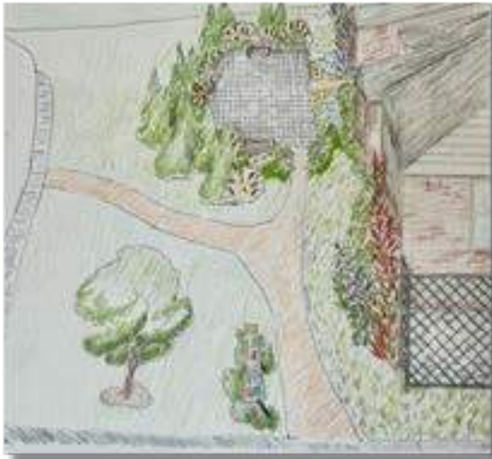
The Secret Garden

The transformation of the grounds takes the visitor from the turn-of-the-century traditional, Midwestern estate garden through the romantic, transitional style that is still present in our community and beyond.