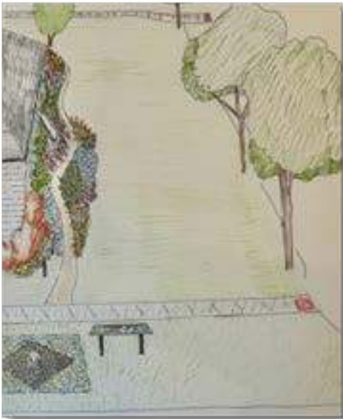
The Midcentury Garden

GARDEN HISTORY IS OUR HISTORY, WITH NATIONAL INFLUENCE THAT REMAINS TODAY