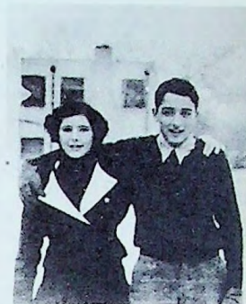
The Winter Club started many a romance