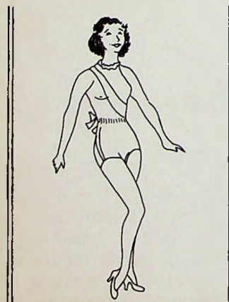
If we can't get more pictures