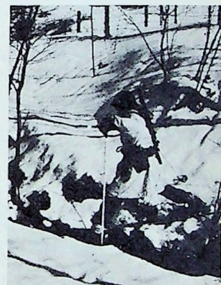
The "Yank" catches Bill Douglas in Italy