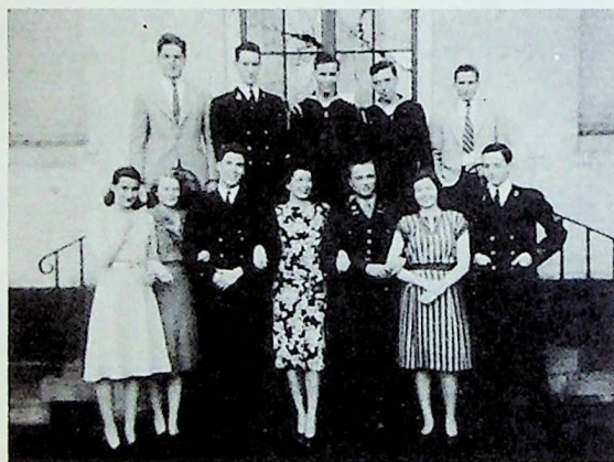
Celebrating Phelps Gold Bar