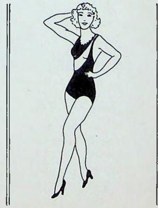
— we invent our own