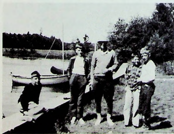
Another guessing game