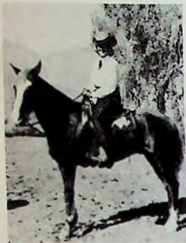
A swell background for A swell girl