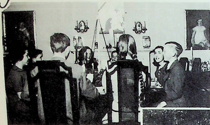
A Christmas party - way back when A modern breakfast party →