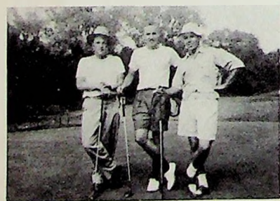
Our high ranking officers at play