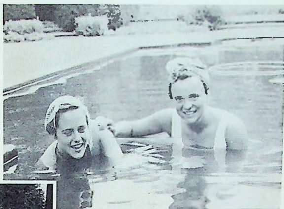
The lilies in the Phelps' pool were plenty surprised