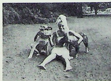
Beauty and the beasts