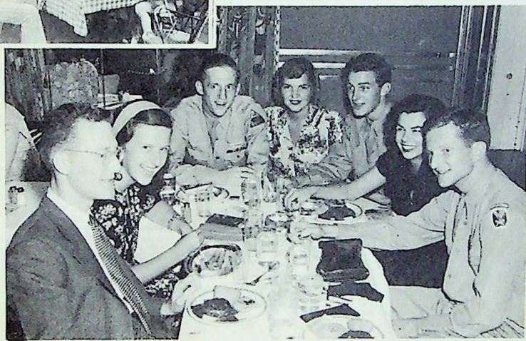
A dinner at the Blackhawk